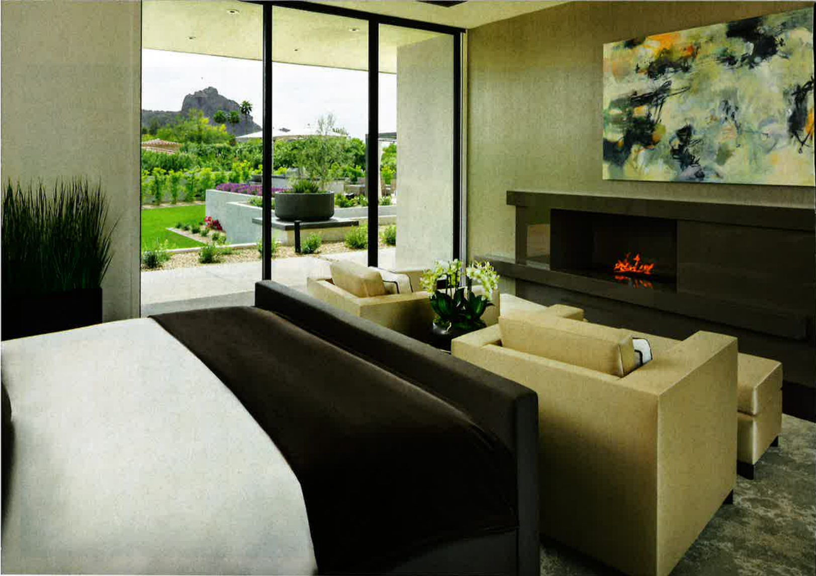
ABOVE With a view of the Praying Monk rock formation on Camelback Mountain, the master bedroom offers a serene place to relax after a stressful day. The homeowners made a conscious decision to keep TVs out of the bedrooms, instead relying on plush furnishings and luxe textiles to set a relaxing mood. RIGHT The master bathroom, with its dark wood cabinetry and matching tile wall cladding, exudes a spa-like atmosphere with a masculine edge.