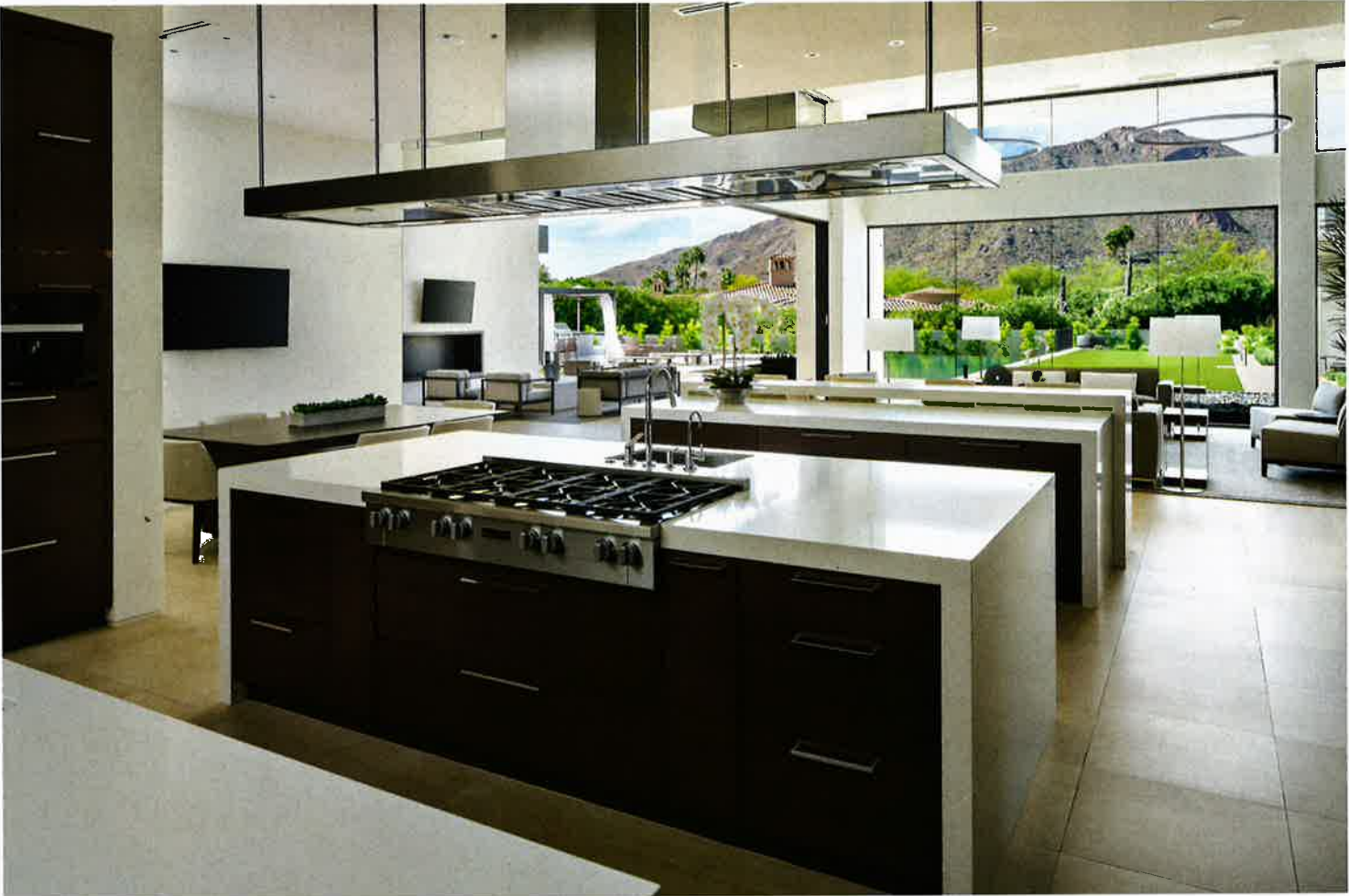
OPPOSITE The rich walnut grain of the dining table, the repetitive patterns of fern containers, chrome pendant lamps and the pass-through fireplace add interest to the dining room and entrance. TOP RIGHT Large walls of glass that open to the backyard and its mountain views beyond underscore the home's airy open concept. The range hood's slimline design allows for its substantial size without blocking the scenery. BOTTOM RIGHT The kitchen's three islands, all with bright white waterfall countertops, provide plenty of space for dining, school work, cooking and entertaining.