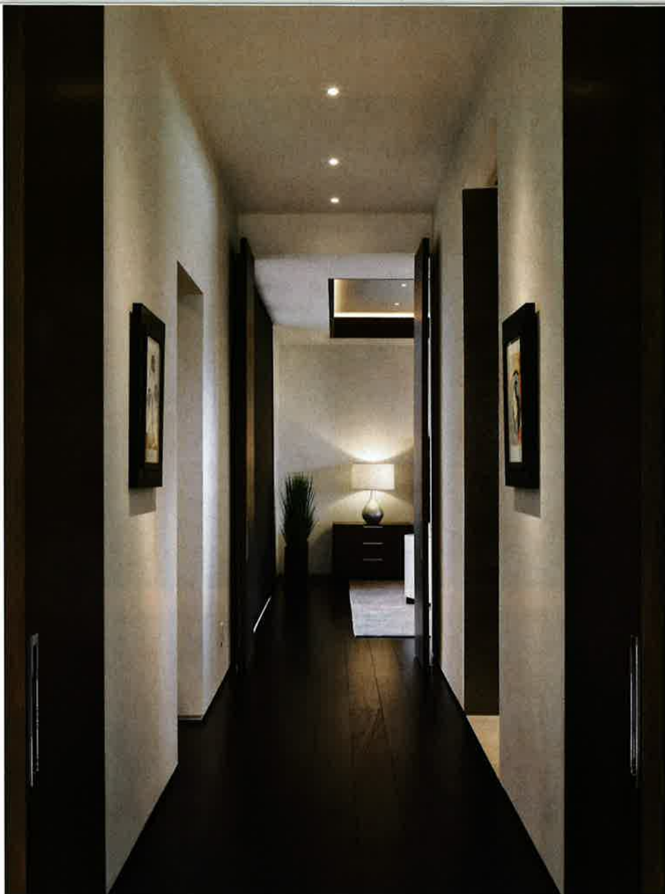
LEFT The rich tones of the flooring, doors and trim add timeless appeal to the hallway that leads to the master bedroom. The homeowners had previously lived in Chicago and loved that city's prevalent dark-wood interior design motifs. BELOW An integral concrete sink is a smooth contrast to the raked limestone walls in the powder room.