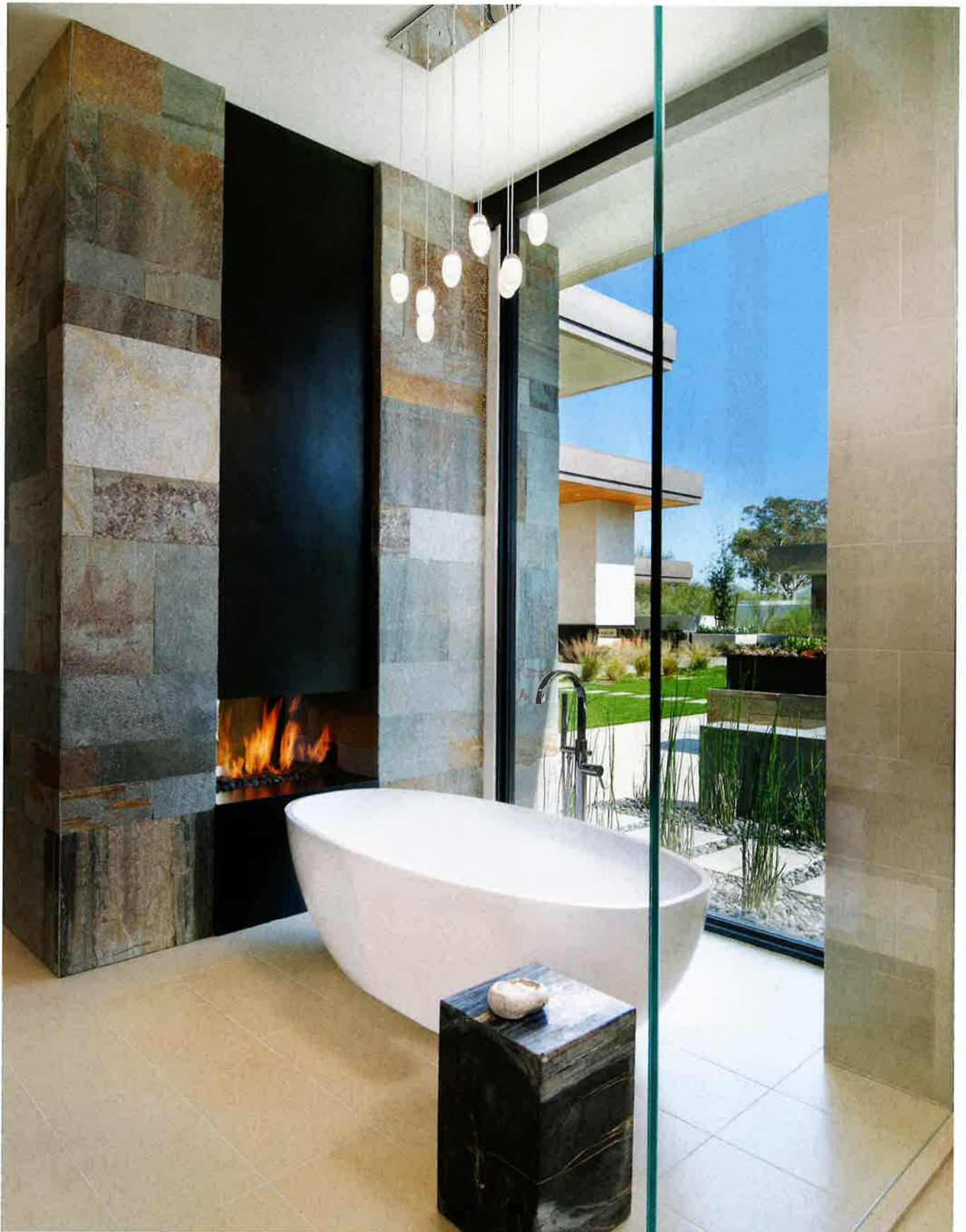
A Kuzco Lighting fixture from Hinkley's Lighting Factory seems to float above the elegant freestanding soaker tub by MTI in the sanctuary-like master bathroom, which shares a two-sided steel fireplace with the adjacent bedroom.